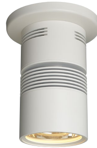
* shown with no accessory

1. Barn Doors Requires 900300 Snoot Accessory.